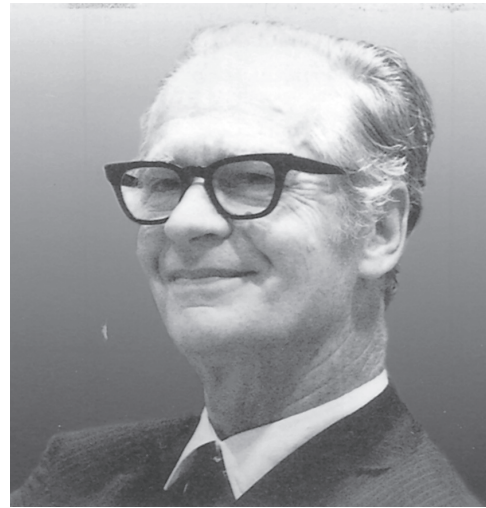
B. F. Skinner ( left ) in his Indiana University lab circa 1945 and ( right ) circa 1967.